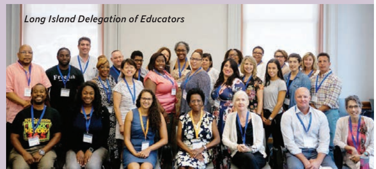
Long Island Delegation of Educators

In 2018, with the support of the Rauch Foundation, ERASE Racism led 20 Long Island educators from five school districts and 11 schools to attend the Institute. The event convened 450 educators from 24 states and eight countries to gain knowledge regarding topics such as cultural and racial literacy, equity pedagogy, anti-racist leadership, and student activism. Through speakers, workshops, and interactive dialogues, attendees were exposed to policies, practices, and implementation strategies that promote cultural literacy and racial equity.