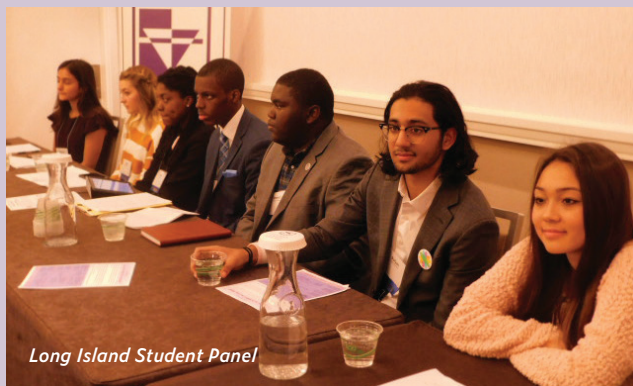
Long Island Student Panel

together a total of 166 students engaged in vibrant discussions of structural racism and its implications for students, schools, and education on Long Island.